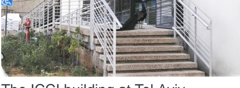
The ICCI building at Tel Aviv University