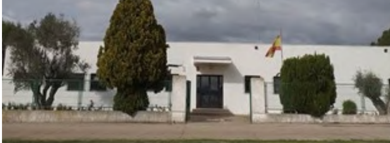
Plant Genetic Resources Center Main building in the field station

The INIA holds the main Spanish Genebank, located at the Plant Genetic Resources Center (Centro de Recursos Fitogenéticos, CRF). The CRF is located in an experimental field station (La Canaleja) in Alcalá de Henares (Madrid). The CRF is in charge of the conservation of the germplasm collections, which includes their multiplication, characterisation and supply of the material to the users. The CRF is also responsible for the coordination of the activities of the Plant Genetic Resources Spanish Network, as well as management and publication of the National Inventory of the Spanish germplasm.