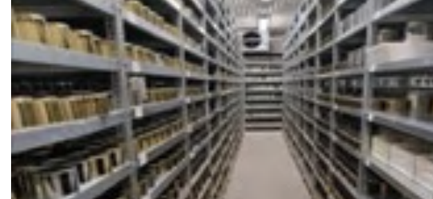
Plant Genetic Resources Center Genebank cold chamber with the base collection

INIA scientists participate in the AGENT project, mainly in WP2, WP3 and WP7. These researchers, belonging to the Environment and Agronomy Department, conduct their work in the CRF. Their research focuses on improving the utilization and conservation of the genebank collections through promoting the phenotyping, genotyping and rationalization of this germplasm.